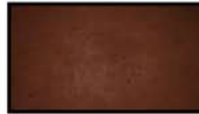
CR-202 French Roast