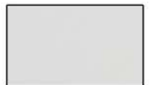
SC-25 True White