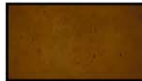
CR-214 Tuscan Brown