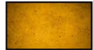
CR-211 Montana Wheat