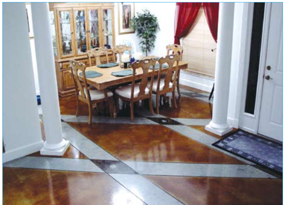
Concrete floors can be luxurious while remaining tough and easy to maintain with decorative concrete engraving.

ing. The reasons for the growing acceptance of decorative concrete engraving are simplicity of process, lower materials cost,