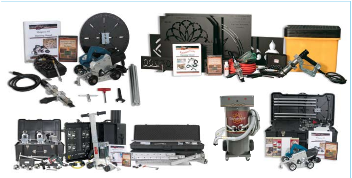
Numerous decorative concrete engraving tools are available.

this may include horses for the equestrian, ship's wheels for the boater. The opportunities are nearly endless.