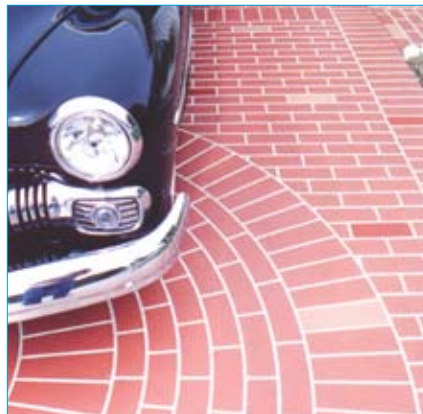
Decorative concrete engraving is a service that can be sold for interiors and exteriors and allows for personalization with the engraving of nearly any pattern or graphic.

The sale of decorative concrete Engraving services is an art as well. The traditional approach of showing a photo album of past jobs or suggesting that purchasers visit past jobs is no longer enough. The sophistication of decorative concrete engraving has allowed for the introduction of customized simulation software. Picture a scenario where you visit a prospect job site and, when first arriving, snap a digital photo of the location. While interviewing the prospect this photo is downloaded into a laptop and, as your prospect articulates their vision, you work with the software to simulate patterns, colors, and graphics that your prospect is describing on the photo image of the actual job location. In the case of corporations or commercial enterprises, a right-click on a logo or emblem on a prospect's Web site allows the salesperson to drop the graphic into